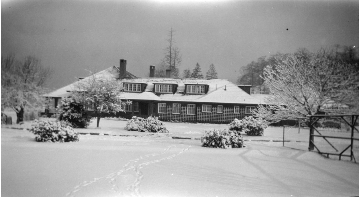
Notation by Leonard Frank, photographer. Shows historic Jericho country club.