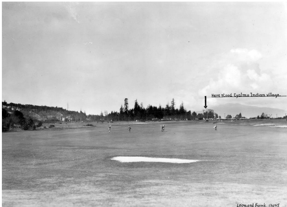
Shows historic Jericho golf club.